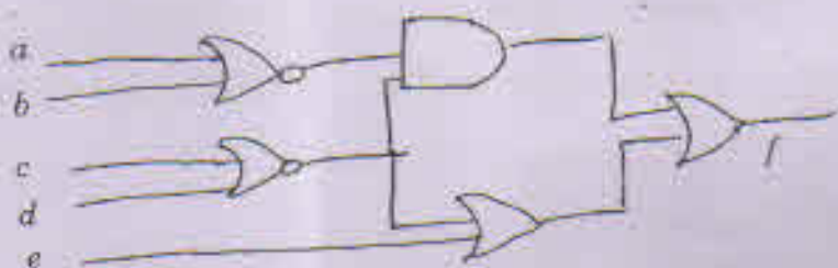
Fig. 11 (b) (i)