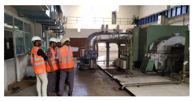
IV EEE students on an internship training programme at Chettinad Cements Private Ltd., Karikkali, Dindigul

5 students from final year EEE went on a 5 - day internship training programme in Chettinad Cements Private Ltd., Karikkali, Dindigul from 10<sup>th</sup> December, 2019 to 13<sup>th</sup> December, 2019. During the training programme, they learned the packing process, operation of belt conveyor, equipments used in power house as well as their working principles, function of SF6 circuit breaker and the X ray testing process.