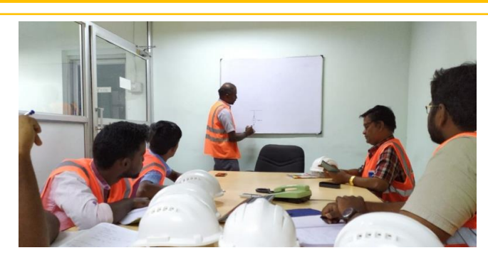
Students at technical sharing session at the time of internship