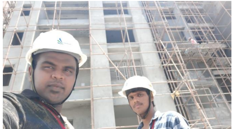
Our CIVIL students at the construction site of Burgundy

Our third year Mechanical Engineering students underwent a four-day internship-cum-inplant training programme from 24.06.2019 to 27.06.2019 at Chettinad Cements, Puliur. 15 students participated the in-plant training and updated their perspectives and skills in the corresponding technical fields.