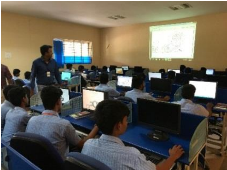
Our students attending Hands on Training on "AutoCAD"

The Department conducted a one day training on 'Engine Assembly' on 26.06.2019 for the II Year Mechanical students. The training gave a clear idea to the students about the basics, techniques, features, practical applications of modern engines, various parts and its functions and the procedure for assembly as well as dismantling.