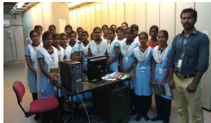
Our ECE students on an industrial visit to BSNL, Karur

Our ECE students visited Kerala Electrical & Allied Engineering, Cochin on 26.07.2019. 85 students visited the industry and got updated with the technical operational processes.