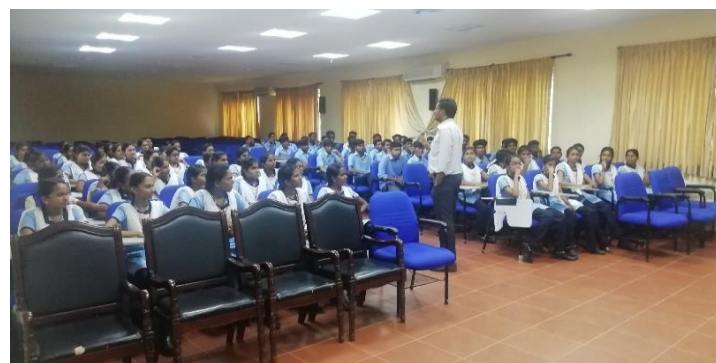
Awareness programme on "Jal Shakti Abhiyan Campaign" of the Department of Drinking Water and Sanitation, Ministry of JalShakthi, Government of India

Engineering is not only study of subjects but it is moral studies of intellectual life.