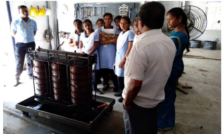
24 students from II EEE went for an Industrial Visit to Walwahan Renewable Energy Pvt. Limited., Veeriyampalayam, Krishnarayapuram, Karur on 25.6.2019. The students visited the industry and updated their technical knowledge on Modern Renewable Energy sources.