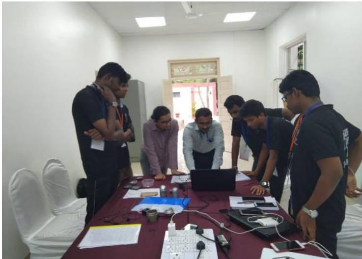
File Photo – Our students interacting and experimenting at Forbes Marshall Pvt. Ltd, Indian Institute of Science Education and Research, Pune.