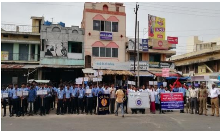
Our students ending “Water Harvesting and Water Conservation Awareness rally” at Puliyyur Bus stop