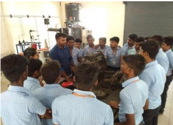
II MECH Students at one day Engine Assembly Training

The Department conducted a one day training on 'Engine Assembly' on 26.06.2019 for the II Year Mechanical students. The training gave a clear idea to the students about the basics, techniques, features, practical applications of modern engines, various parts and its functions and the procedure for assembly as well as dismantling.