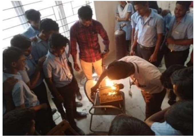
Our II MECH students attending Hands on Training on 'Casting Process'

An experimental training on 'Injection Moulding' was conducted by the department from 24.06.2019 to 25.06.2019 for III Year Mechanical students. Students were given training on designing and making products on single and multi-cavity.