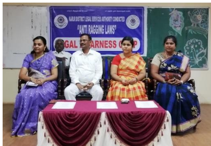
3 Judges from the Sub Court of Karur interacting with our students in our campus at a legal awareness camp about "Anti Ragging Laws"