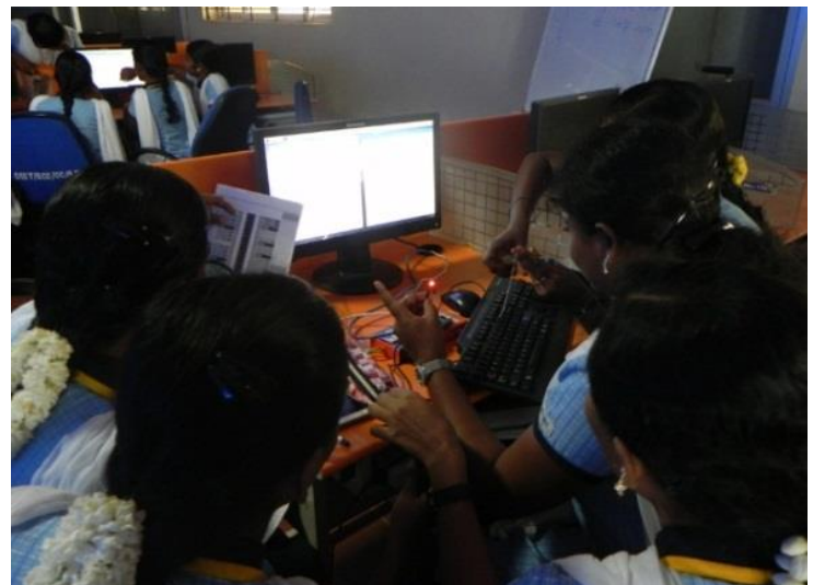
Our students getting trained by the Trainers from Galwin Technology, Trichy at our campus