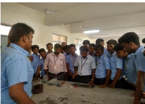
Our II MECH students attending Hands on Training on 'Injection Moulding'

A Hands-on-Training Programme on 'Injection Moulding' and "Casting Process" was given to II year Mechanical students on 28.06.2019. Students got experimental knowledge and practice on melting of plastic gems, moulding material inside the heating cylinder, created moulded product into the die cavity and solidification along with sand casting methods for materials.