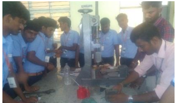
III MECH Students attending 'Injection Moulding' Training

An experimental training on 'Injection Moulding' was conducted by the department from 24.06.2019 to 25.06.2019 for III Year Mechanical students. Students were given training on designing and making products on single and multi-cavity.