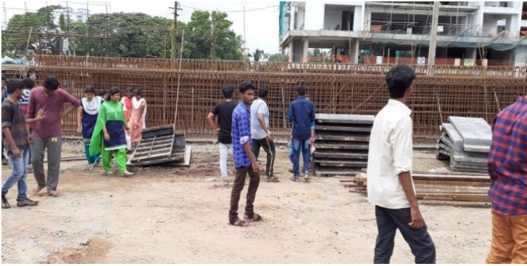
Our CIVIL students at Madappally Builders, Kottayam