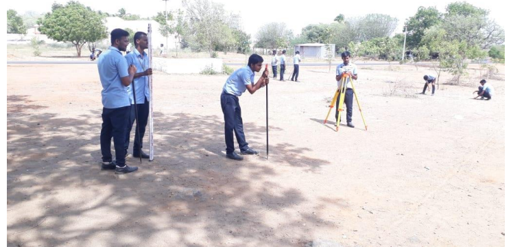
Our students at Palamalai Survey Camp

Scientists investigate that which already is; Engineers create that which has never been