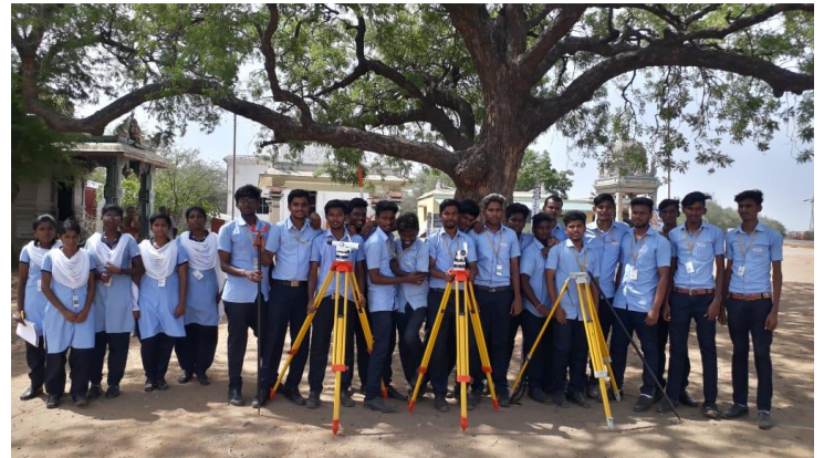
Our students at Palamalai Survey Camp

The Department of Civil Engineering organized a Survey Camp at Palamalai, Karur from 24.06.2019 to 28.06.2019. Twenty six students attended the camp and got training on surveying strategies.