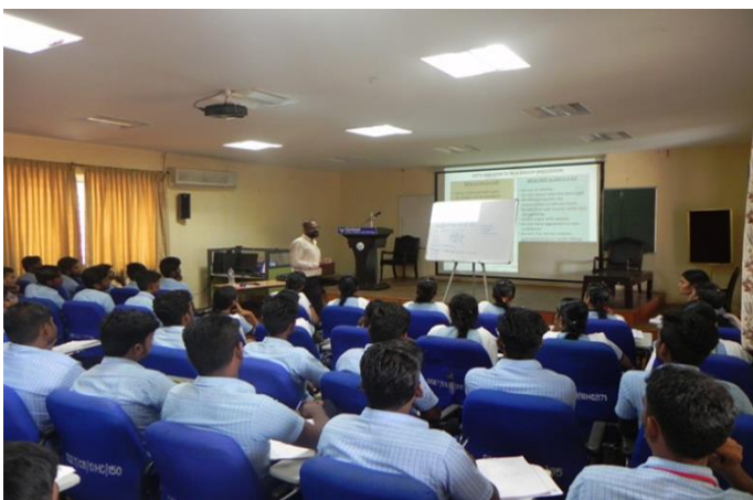
Trainer from Yardstick Training and Placement Academy, Coimbatore training on Aptitude and Soft Skills to our students