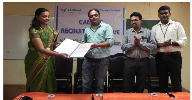
Recruiters from Augusta Hi-tech soft Solutions, Coimbatore handing over the offer letters of the selected students