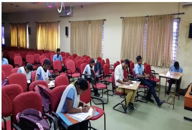
Our students at essay writing competition conducted on Kamarajar's birth anniversary