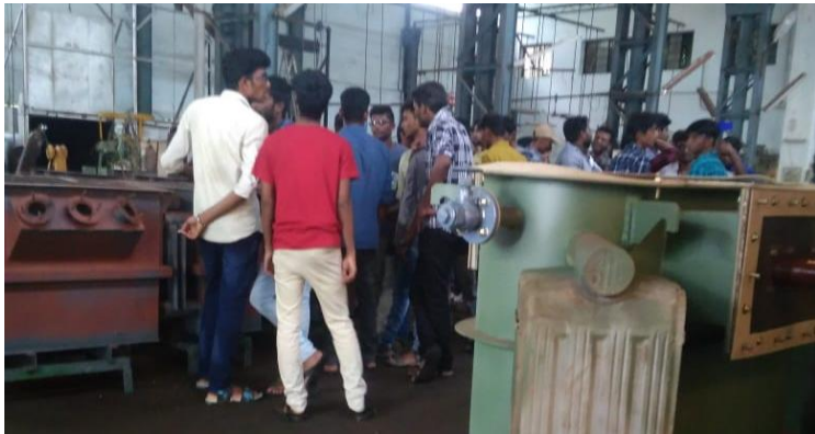
An industrial visit was arranged to Lockhart Tea Factory, Munnar by the department on 27.07.2019. The students visited the factory and learnt about the electronics and communication processes involved in the operation of the machineries in the factory.