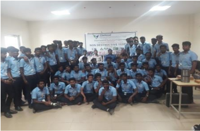
III MECH students at the workshop on “The application of non-destructive testing”

A one-day workshop on “The application of non-destructive testing” was conducted by the department for the III year students. The workshop was conducted on 28.06.2019 and students were given exposure to Ultrasonic testing, Radiographic testing, Ultrasonic thickness gauging, and Radiographic film interpretation.