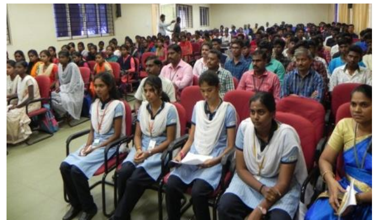
Our new batch of First Year Students