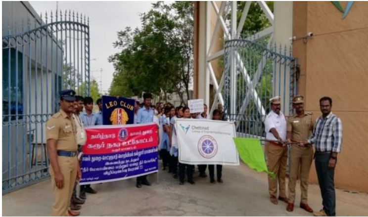
Our students starting “Water Harvesting and Water Conservation Awareness rally” from the college

➤ A rally was organized for “ Water Harvesting and Water Conservation Awareness ” in connection with the Jal Shakti Abhiyan Scheme of the Government of India on 29.07.2019. The rally started at the Main Gate of Chettinad College of Engineering and Technology and ended at Puliyyur Bus Stop. Students belonging to II year Civil, EEE and Mechanical Engineering actively participated in the rally with slogans and placards.