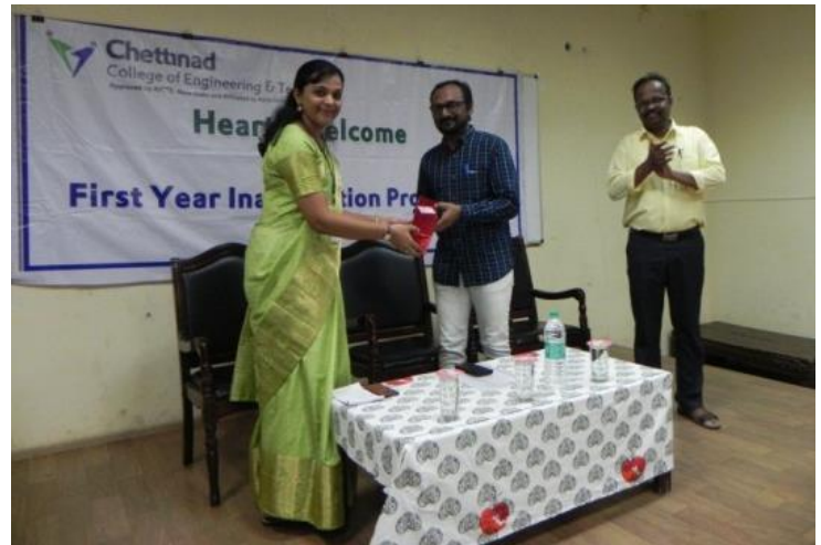
Principal honouring the Chief Guest