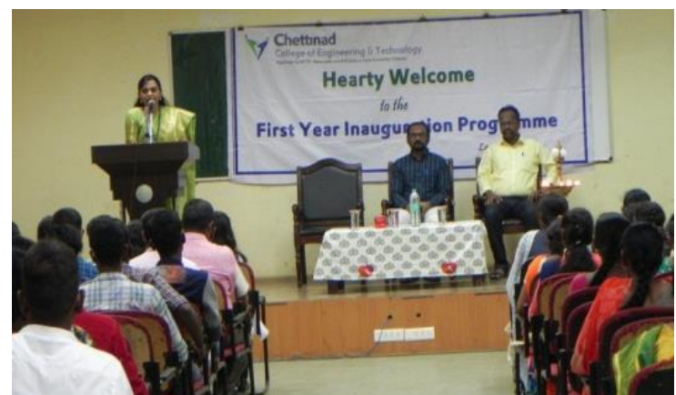
Principal delivering the welcome address