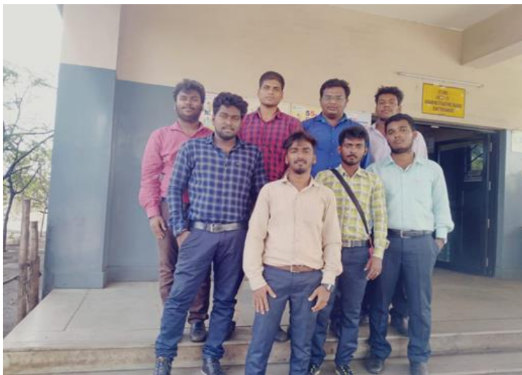
II MBA students on inplant training at Chettinad Coal Terminal Private Ltd., Chennai.

Our young aspiring management trainees from II MBA underwent a six-day in-plant training at Kamarajar Port Limited, Chennai from 17.06.2019 to 22.06.2019. 8 management trainees of Chettinad Tech undertook the training and acquired mastery over organizational and coordination skills.