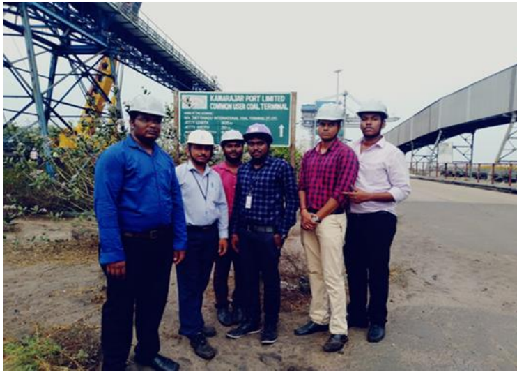
Our aspiring Management Trainees on inplant training at Kamarajar Port Limited, Chennai

Our young aspiring management trainees from II MBA underwent a six-day in-plant training at Kamarajar Port Limited, Chennai from 17.06.2019 to 22.06.2019. 8 management trainees of Chettinad Tech undertook the training and acquired mastery over organizational and coordination skills.