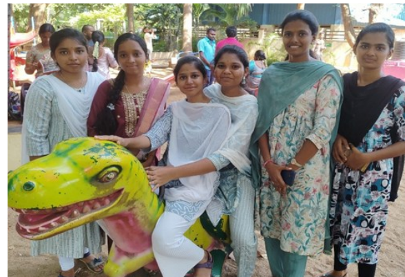
Visit to Mayanoor Dam and Park