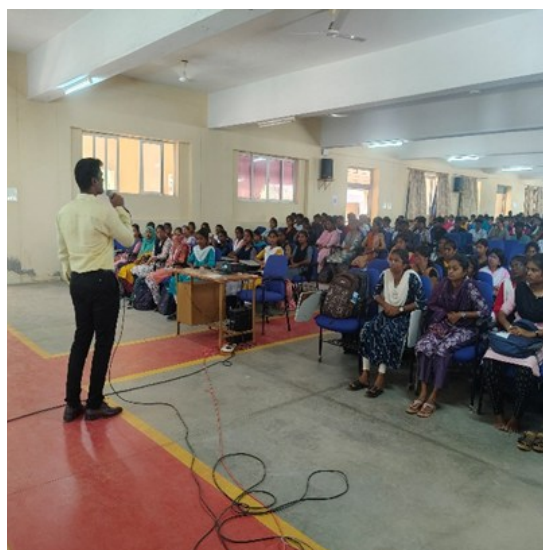
I - Year Orientation programmes