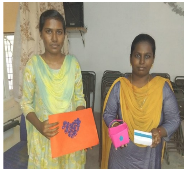
Students Art Work