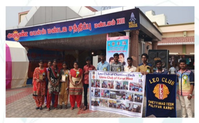
Leo coordinator along with the Leo volunteers at the Lions-Leo International Regional Meet

Leo Office board members were honored with shields for their active participation and projects in the meet.