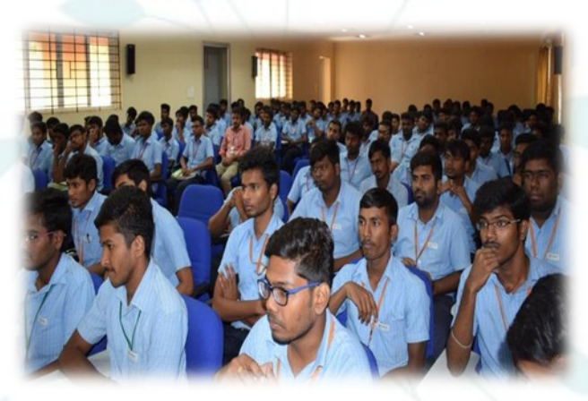
Students keenly absorbing the information