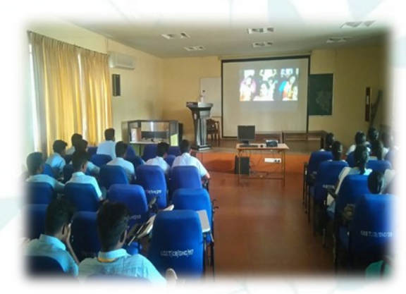
Students watching the movie