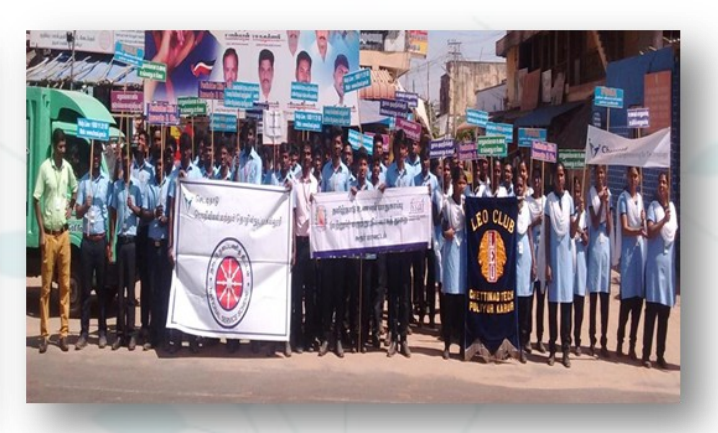
Students with placards emphasising food awareness