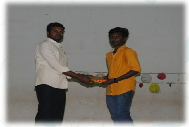
Winners receiving the prize