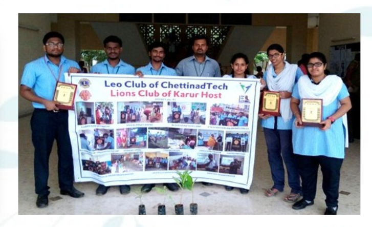
Leo Club coordinator along with the Leo volunteers