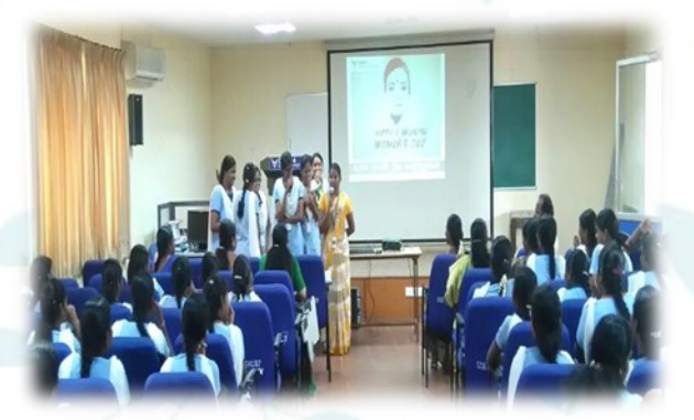
Staff and students singing at the function