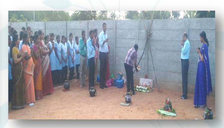
Offering pooja to the gods on the day of pongal celebration