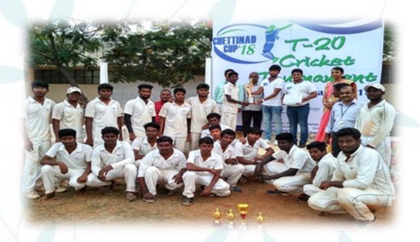
Runners up with the trophy