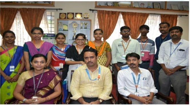
Students placed in Digital Nirvana