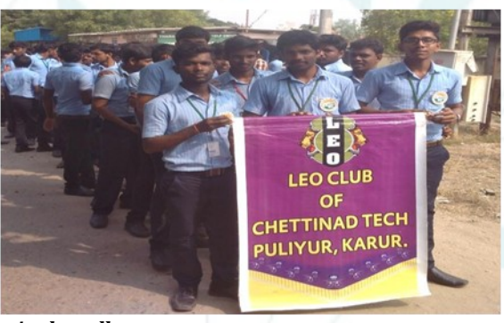
Students participation in the rally