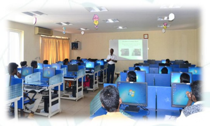
Mr.M.Kumar, Asst.prof/ ECE conducting the session