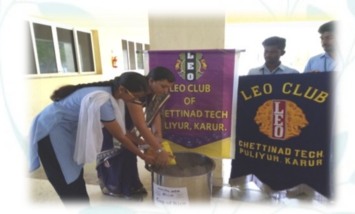
Principal and students contributing rice

The staff and students of Chettinad Tech generously contributed rice and groceries from 9.1.2018 to 11.1.2018. Nearly 130 kgs of rice was collected and donated to orphanages and old age homes in Karur.