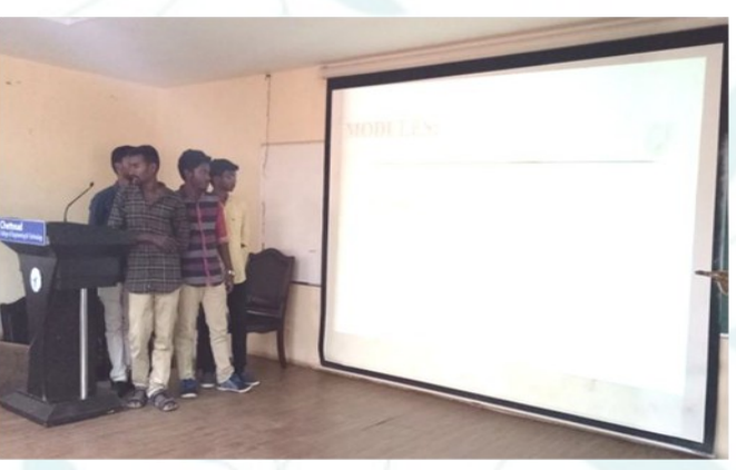
Students presenting their paper at NCCCET'18