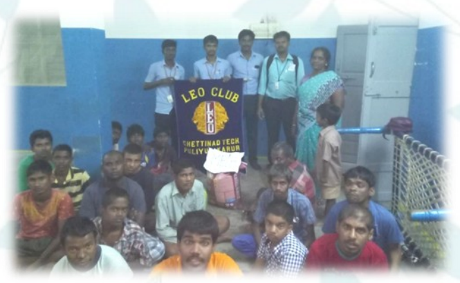
Staff and students donating rice to an orphanage