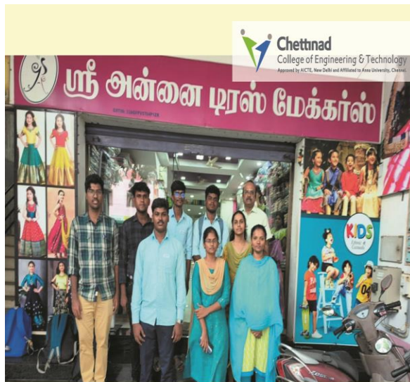
| MBA - MEETING THE ENTREPRENEURS |

Established entrepreneurs often have relevant insights, experience, and advice they can share to help new entrepreneurs on their personal journeys. Interviewing entrepreneurs can help the students learn more about the steps they took to get where they are.